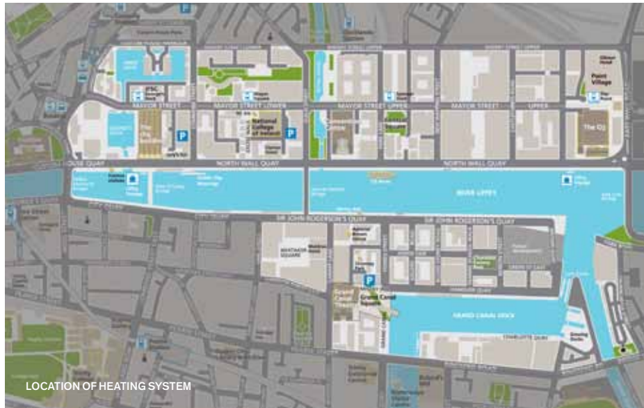
LOCATION OF HEATING SYSTEM