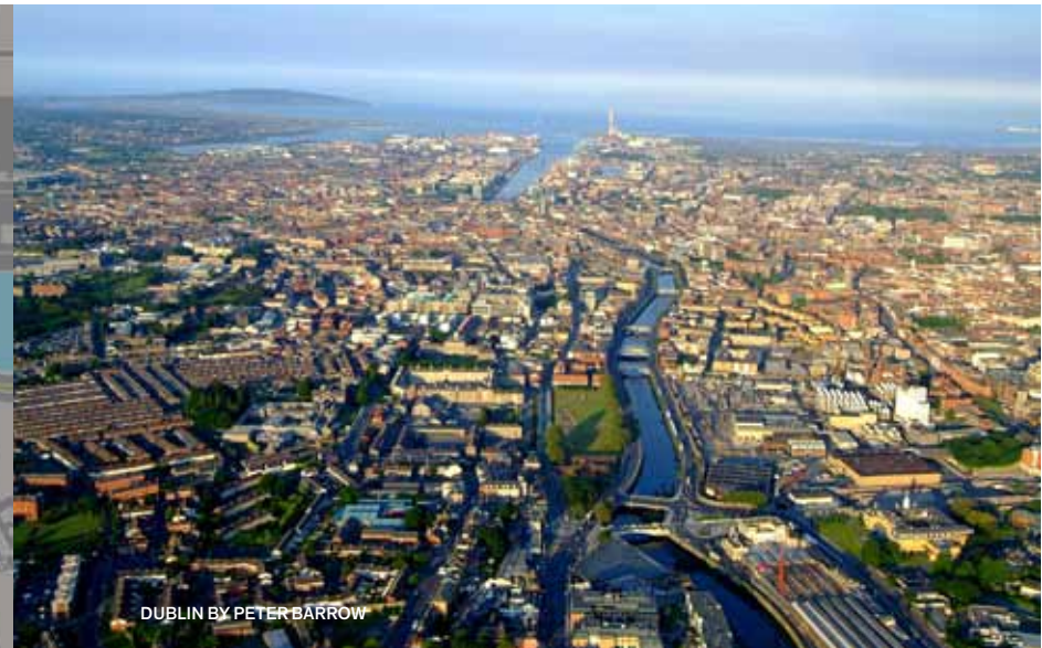
DUBLIN BY PETER BARROW